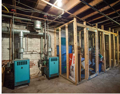
Cellar or Basement