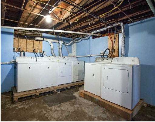
Cellar or Basement