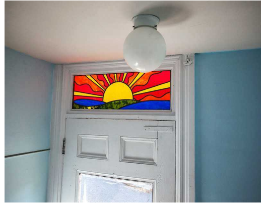
Entry stained glass window