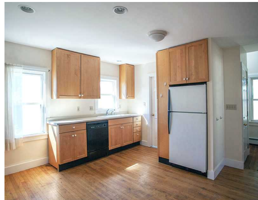
Kitchen 2nd floor unit