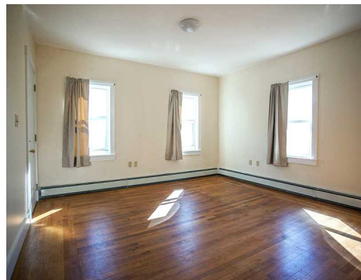
Living Room 2nd floor unit - 2nd floor