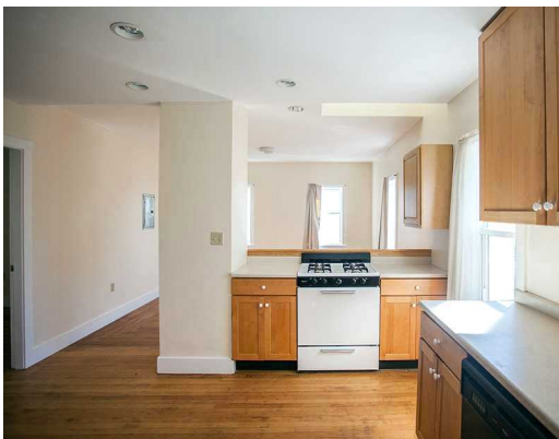
Kitchen 2nd floor unit