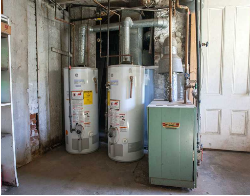
Cellar or Basement