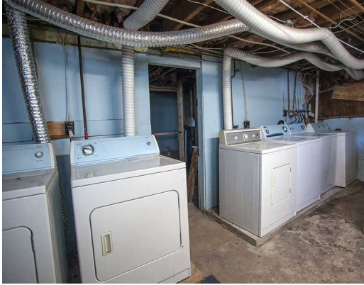
Cellar or Basement