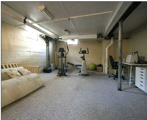
Cellar or Basement