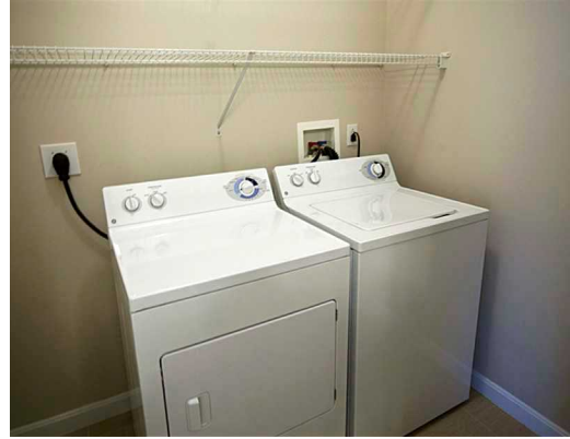
Other In unit laundry