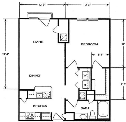
Other Floor plan