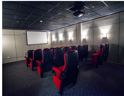
Other movie room